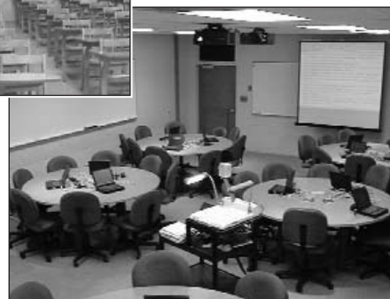
A physics classroom at North Carolina State University arranged for traditional lectures (inset) and redesigned for group problem-solving in the SCALE-UP program.

jors and nonmajors, and outcome assessments indicate high content retention and student satisfaction (8).